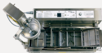
Donut Robot® Mark II / Mark II GP