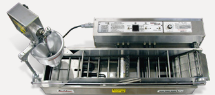
Donut Robot® Mark V / Mark V GP