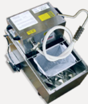
EZ Melt 18